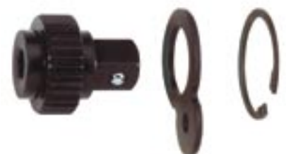
1350-20, 2350-20, 3350-20, 2345-20, 1352-20, 2352-20, 3352-20