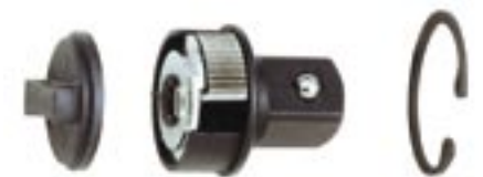
1260-20, 2260-20, 3260-20, 4260-20, 5260-20, 2340-20