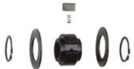
1230-20, 2230-20, 3230-20, 4230-20